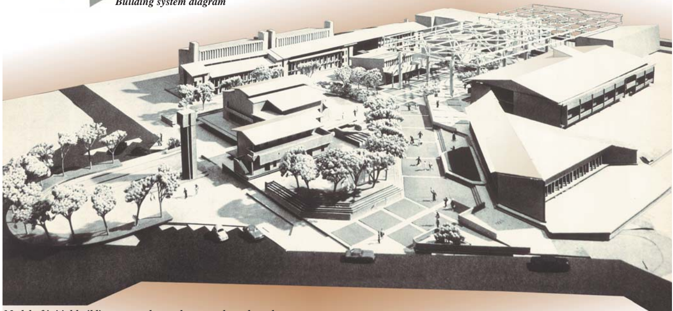
Model of initial buildings around pergola-covered quadrangle